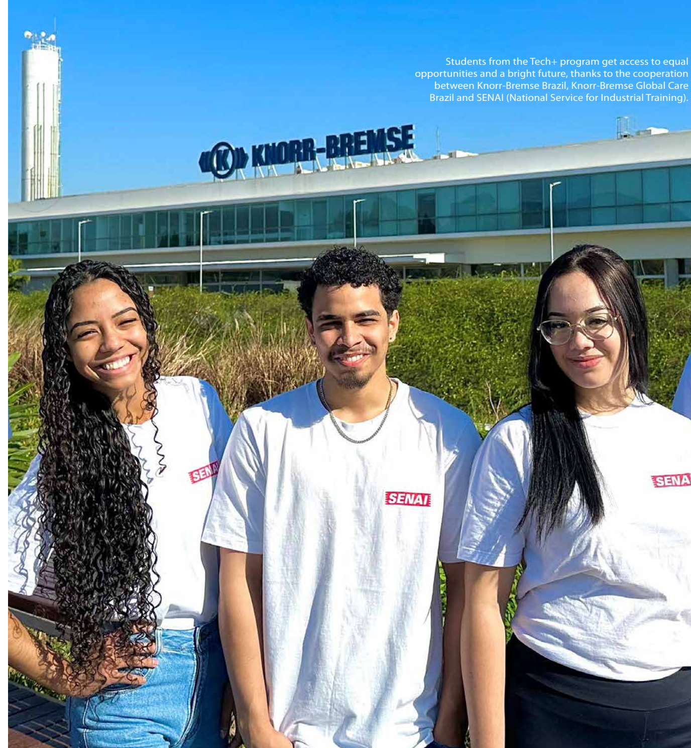
Students from the Tech+ program get access to equal opportunities and a bright future, thanks to the cooperation between Knorr-Bremse Brazil, Knorr-Bremse Global Care Brazil and SENAI (National Service for Industrial Training).

Like the Knorr-Bremse Group, Knorr-Bremse Global Care is determined to contribute to the SDGs. In the light of our key focus areas, we support projects under SDG 4 "Quality education" and SDG 6 "Clean water and sanitation".